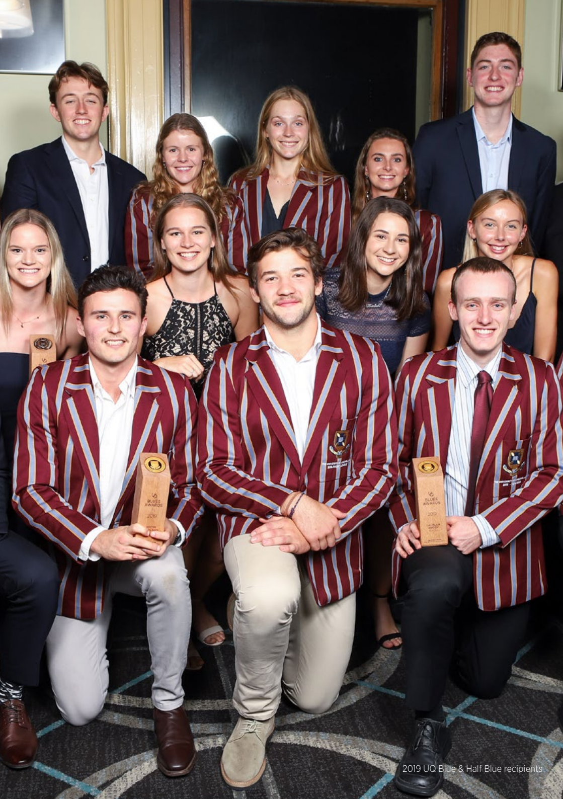
2019 UQ Blue & Half Blue recipients